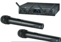
ATW-1322 – Dual Handheld System