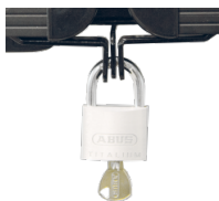
Brackets and wing lock for locking the side wings in front of the display