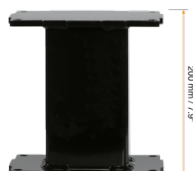
Extender for 2-part height adjustable aluminum columns