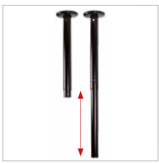
Adjustable drop in 25mm increments for the perfect height positioning with a maximum drop of 1m