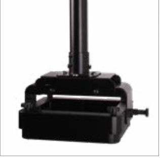
Compatible with a large range of B-Tech Includes cover plate and cable mangement mounts, including projector and screen for a neat and tidy installation