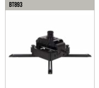
Heavy Duty Projector Ceiling Mount with Micro-Adjustment