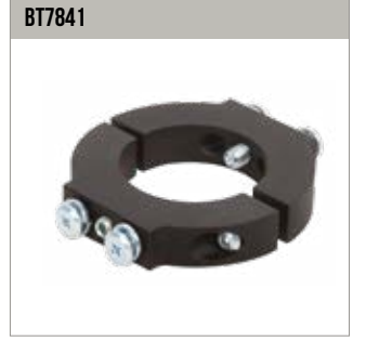
2-Piece Accessory Collar for use with Ø50mm poles