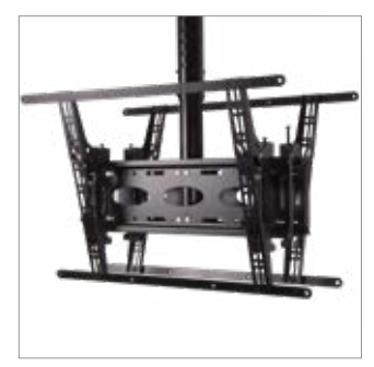
Allows back-to-back configurations to be created when combined with BT8390-CFK Collar Fixing Kits or System X components