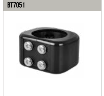
Heavy Duty Accessory for use with Ø50mm poles