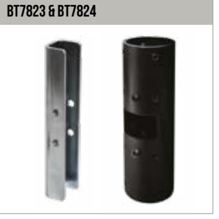
Internal & External Pole Joiners can be used with BT7851 to add longer pole lengths